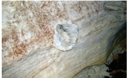
Sedimentary formations ( such as this clay bank exhibiting severe damage from an unthinking diver)