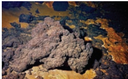
Phreatite (also known as Goethite)