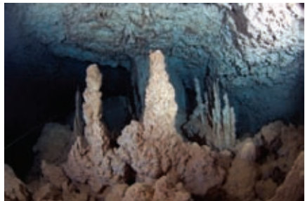
Stalagmites, Stalactites( and other flowstone formations)